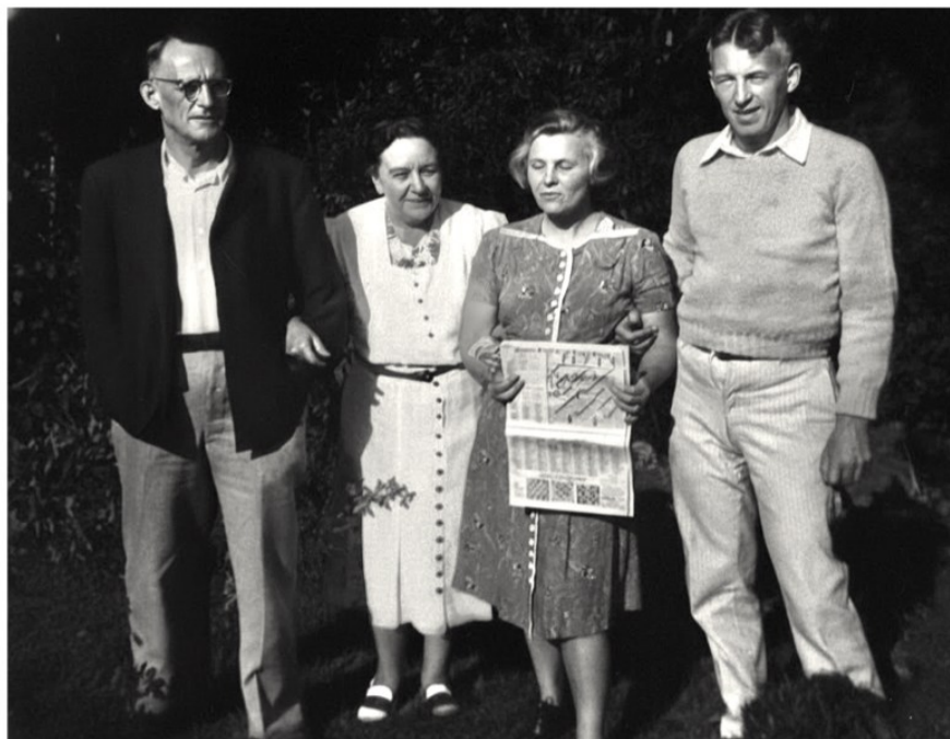
Lois and Bill W.

Join us Saturday MAY 30th, 2026 10am-2pm at our State Office 145 1st Street, Macon, Ga 31201