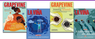
PICPC Continued from Page 3

Gift certificates for digital and Complete Subscriptions are now available in the Grapevine and La Viña stores. Visit aagrapevine.org